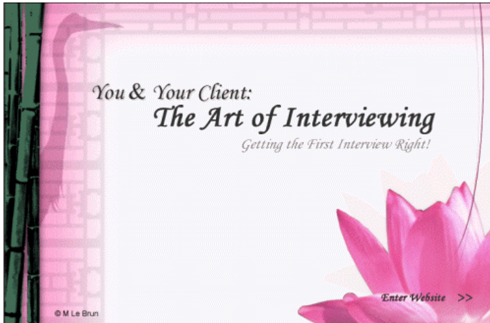
Figure 1: The Art of Interviewing Home Page